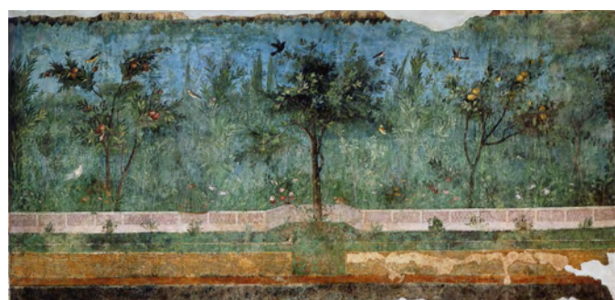
Mural in the garden of the Villa Livia